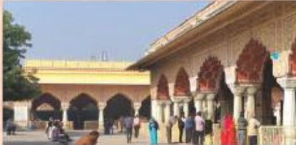
GOVIND DEVJI TEMPLE