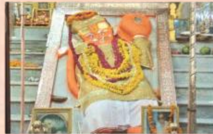
KHOLE KE HANUMAN JI