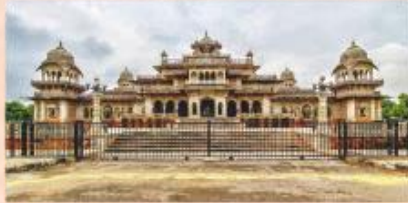
ALBERT HALL MUSEUM