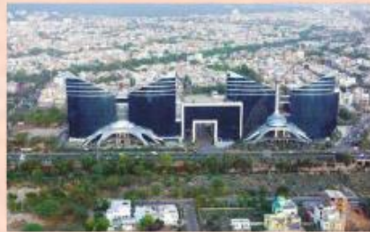
WORLD TRADE PARK